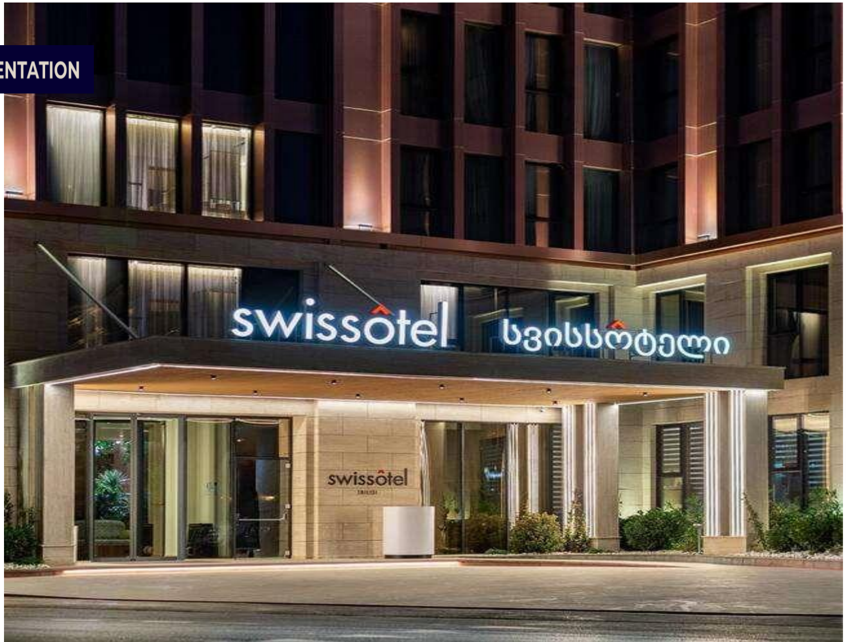
SWISSOTEL TBILISI, GEORGIA HOTEL PRESENTATION TO SALES 2024