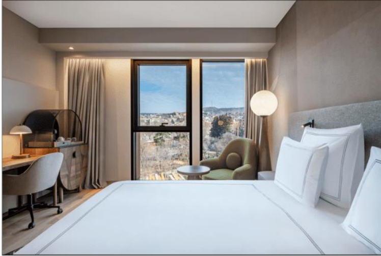
112 Swiss Business Advantage