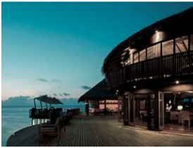
STARS Exclusive À La Carte Restaurant & Bar at Coco Residence

A place to watch both the sunrise and the sunset, Stars is your personal hideaway, offering a taste of tranquility with every bite.