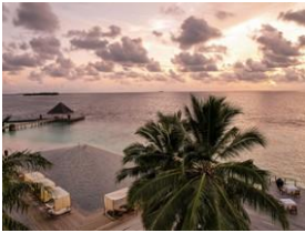
LATITUDE BAR Main Infinity Pool Area

08:00 - 11:00 (Breakfast à la carte for guests staying at Coco Residences only) 12:30 - 14:30 (Lunch à la carte) 19:00h - 21:30 (Dinner à la carte)