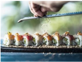
TSUKI Japanese Restaurant

10:00 - 00:00 (Beverages) 12:00 - 17:30 (Snacks)