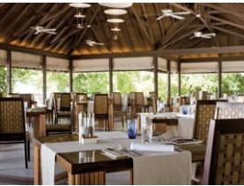
AIR Main Restaurant

Indoor and al fresco seating, day, or night, where the world's flavours dance right by the water's edge.