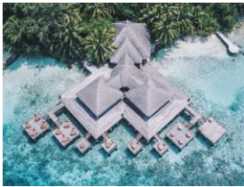
AQUA Seafood Restaurant, Perched Over The Water

07:30 - 10:30 (Breakfast) 12:30 - 14:30 (Lunch) 19:00 - 21:30 (Dinner)