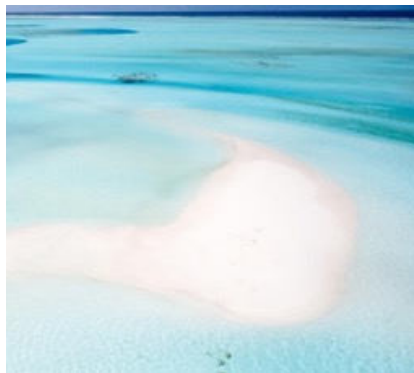
SAND BANK VISIT