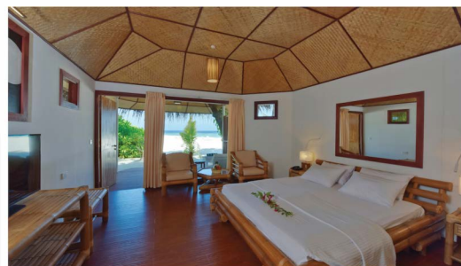
Beach Bungalow (Standard Deluxe)