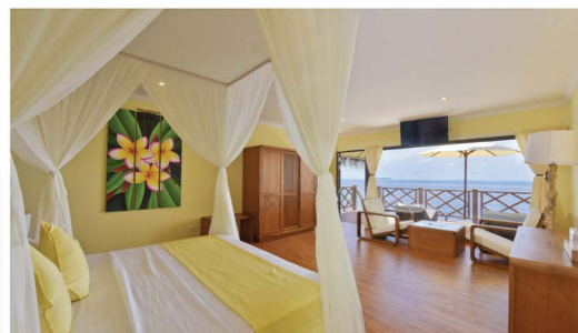
Superior Water Bungalow