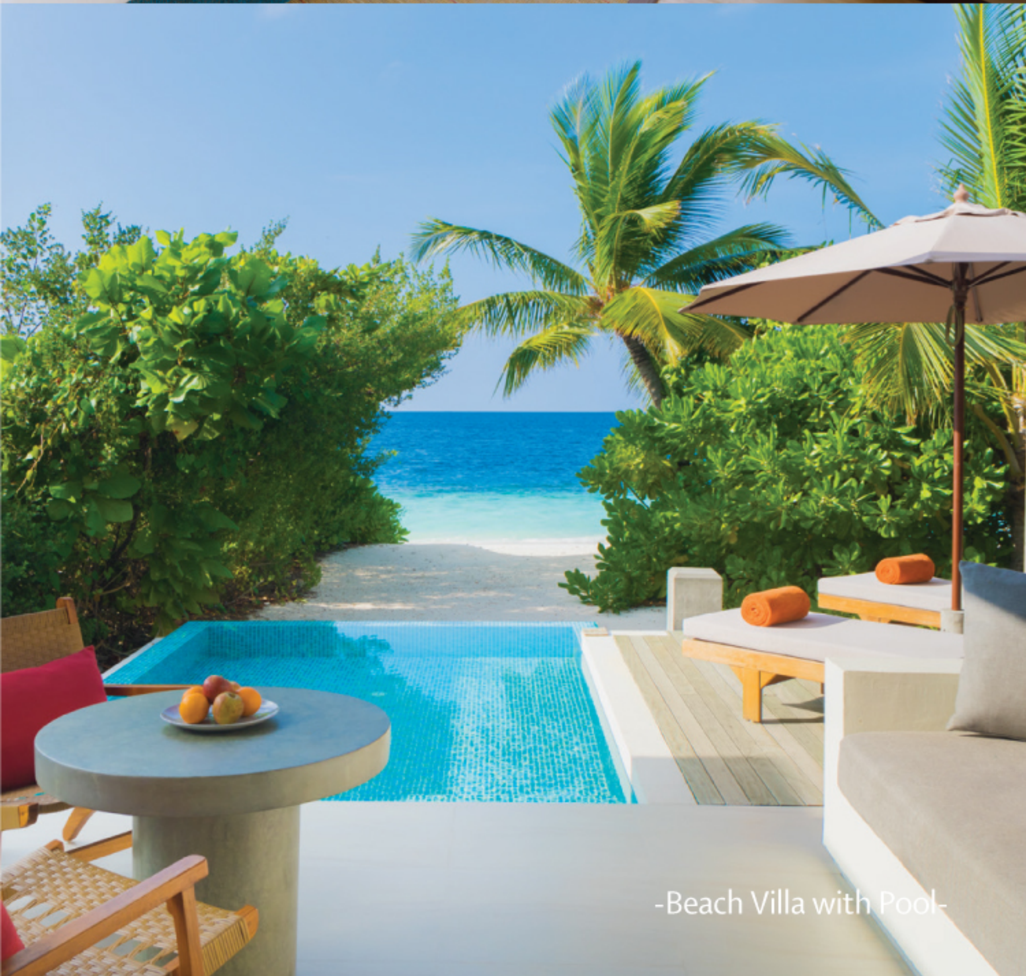
-Beach Villa with Pool-