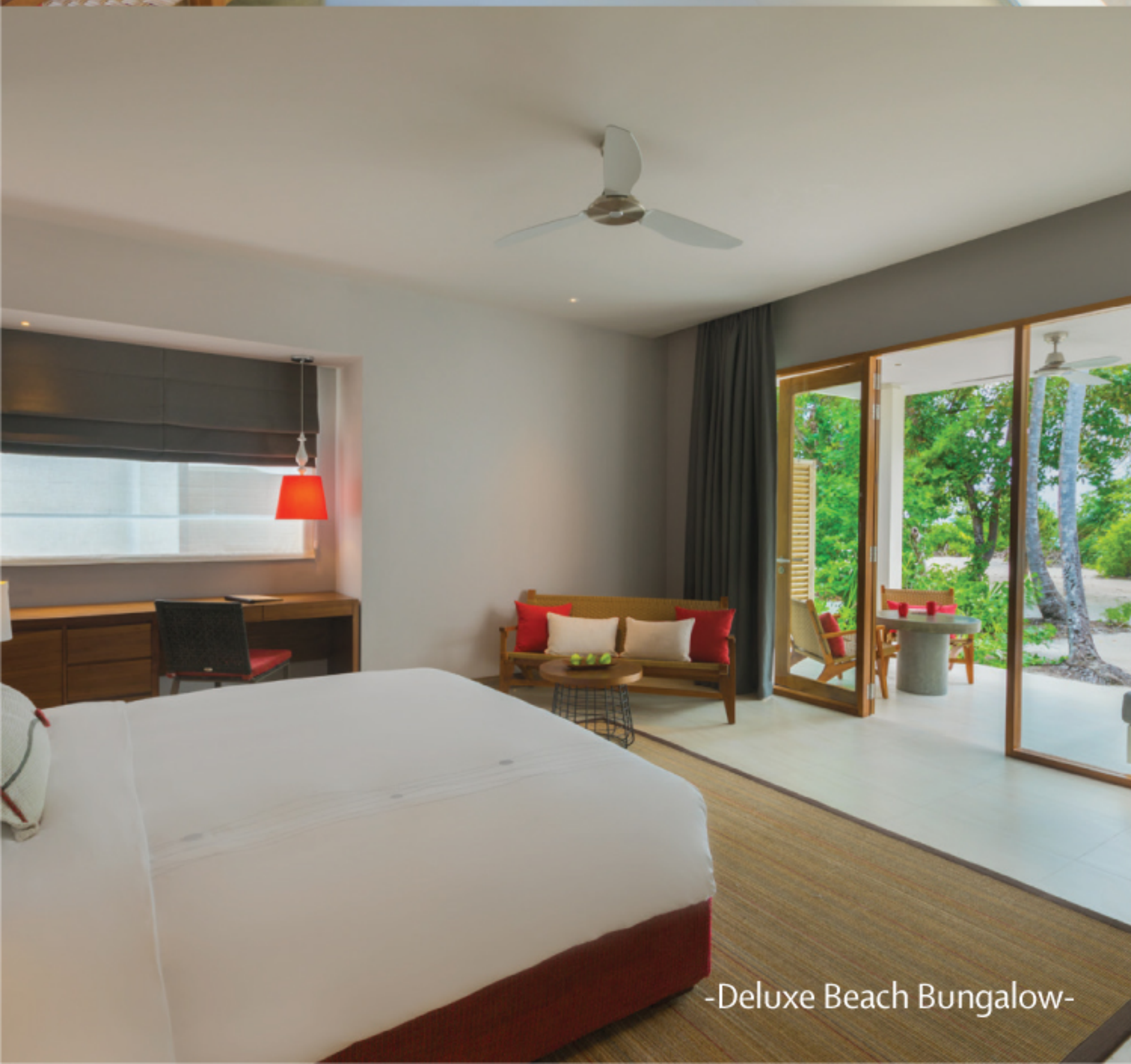
-Deluxe Beach Bungalow-