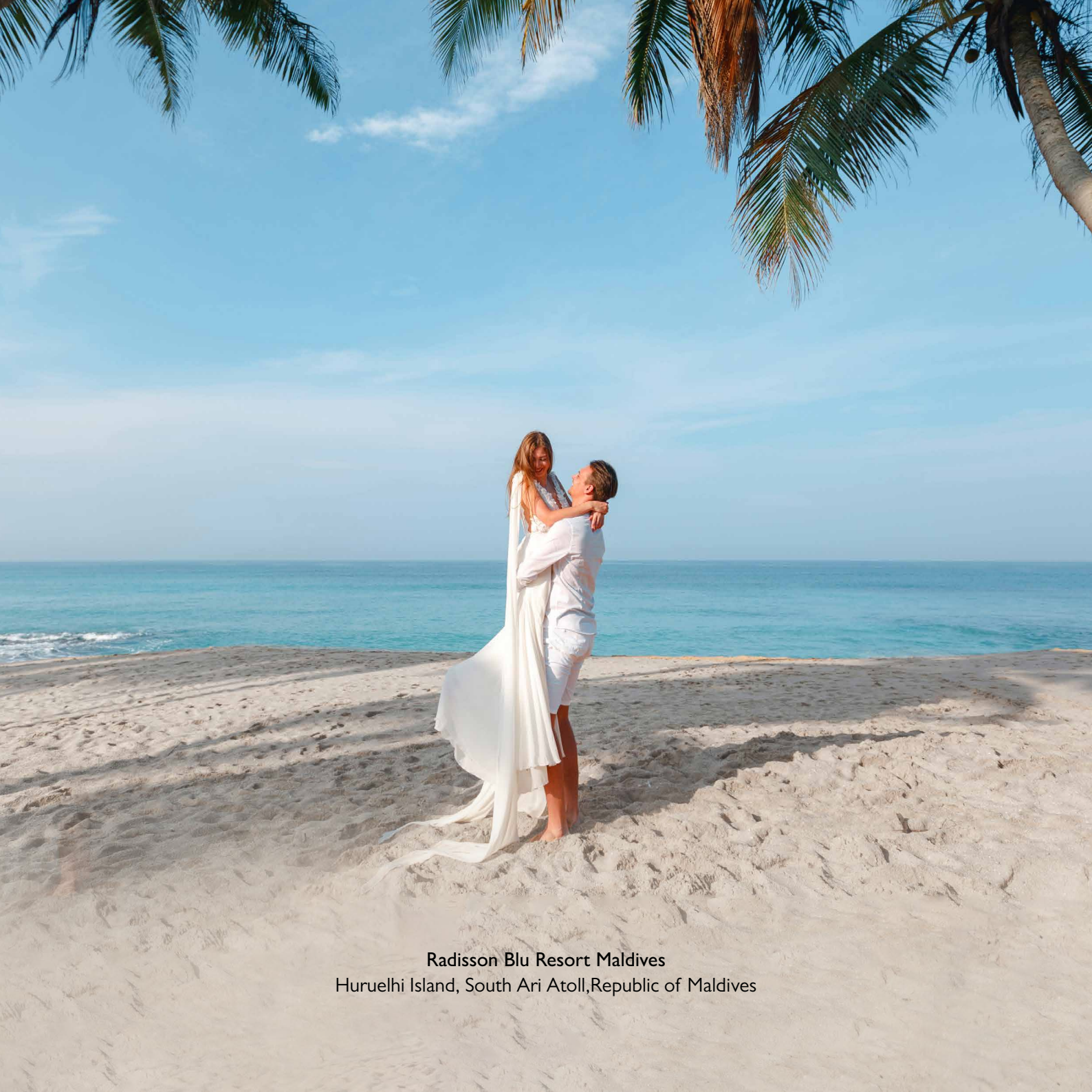
Radisson Blu Resort Maldives Huruelhi Island, South Ari Atoll, Republic of Maldives