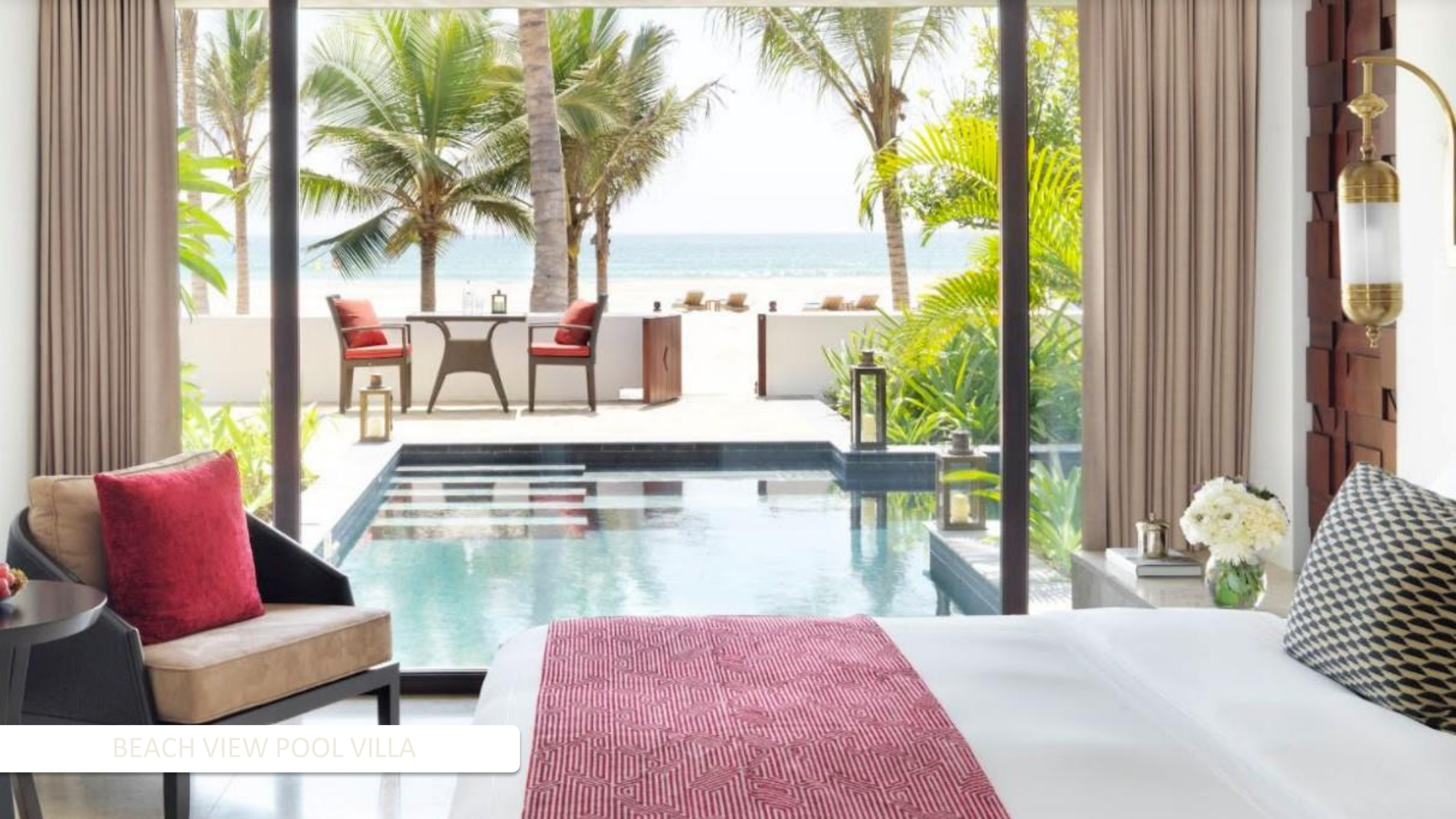
BEACH VIEW POOL VILLA