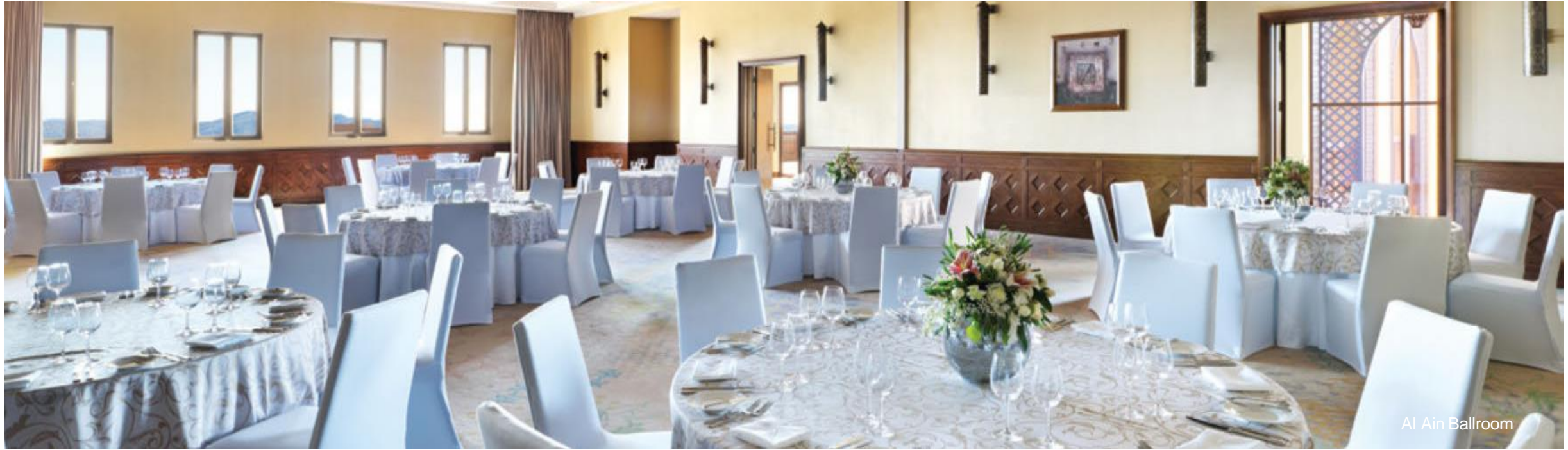
Al Ain Ballroom