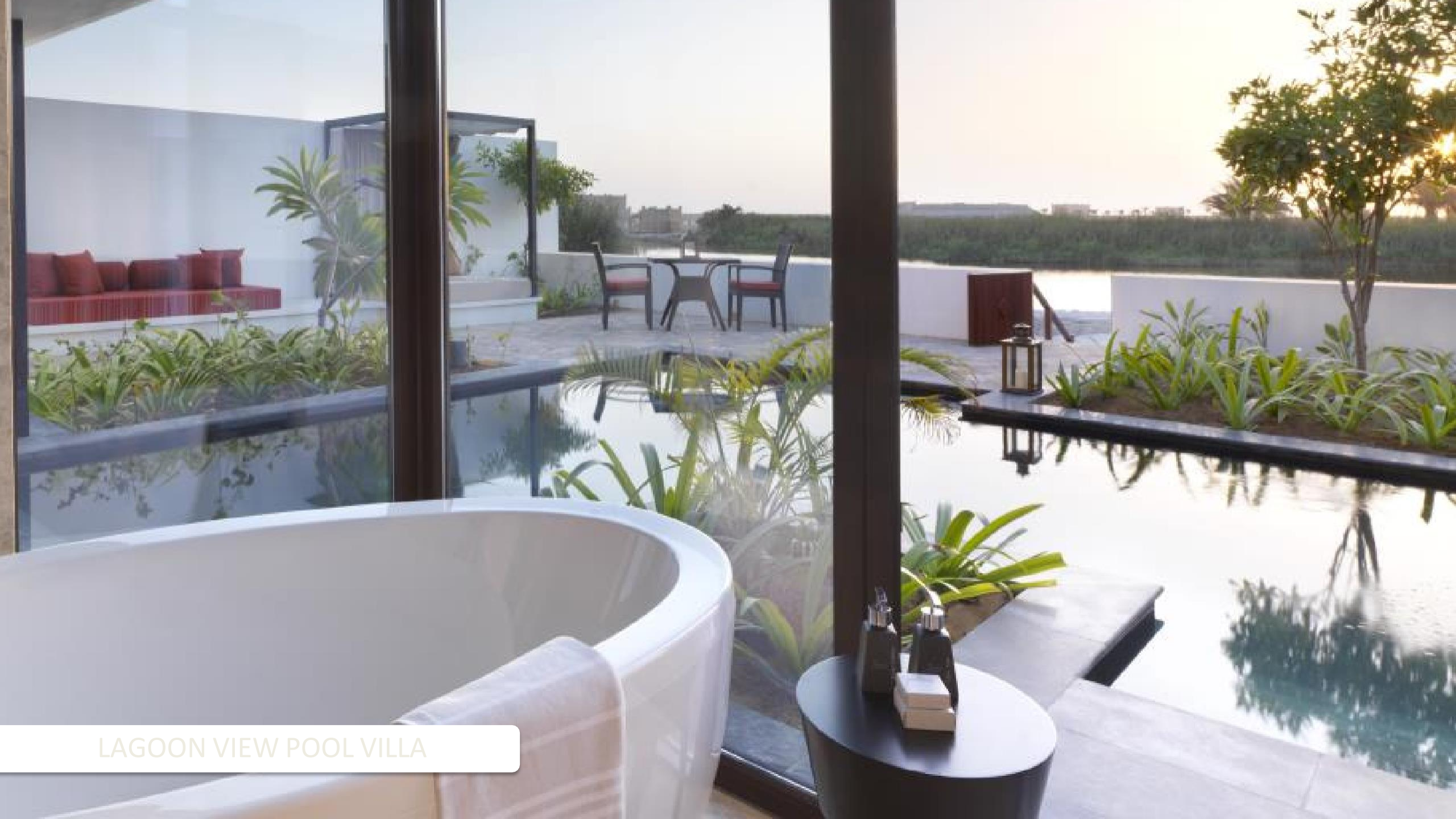
LAGOON VIEW POOL VILLA