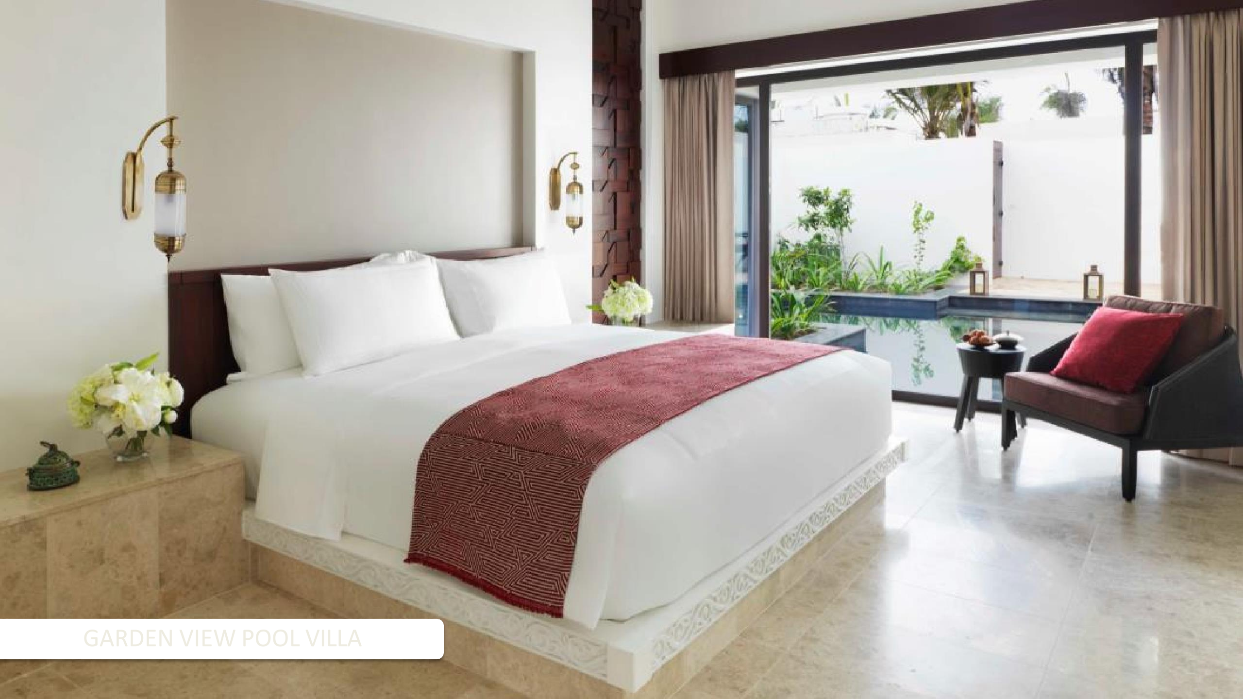
GARDEN VIEW POOL VILLA