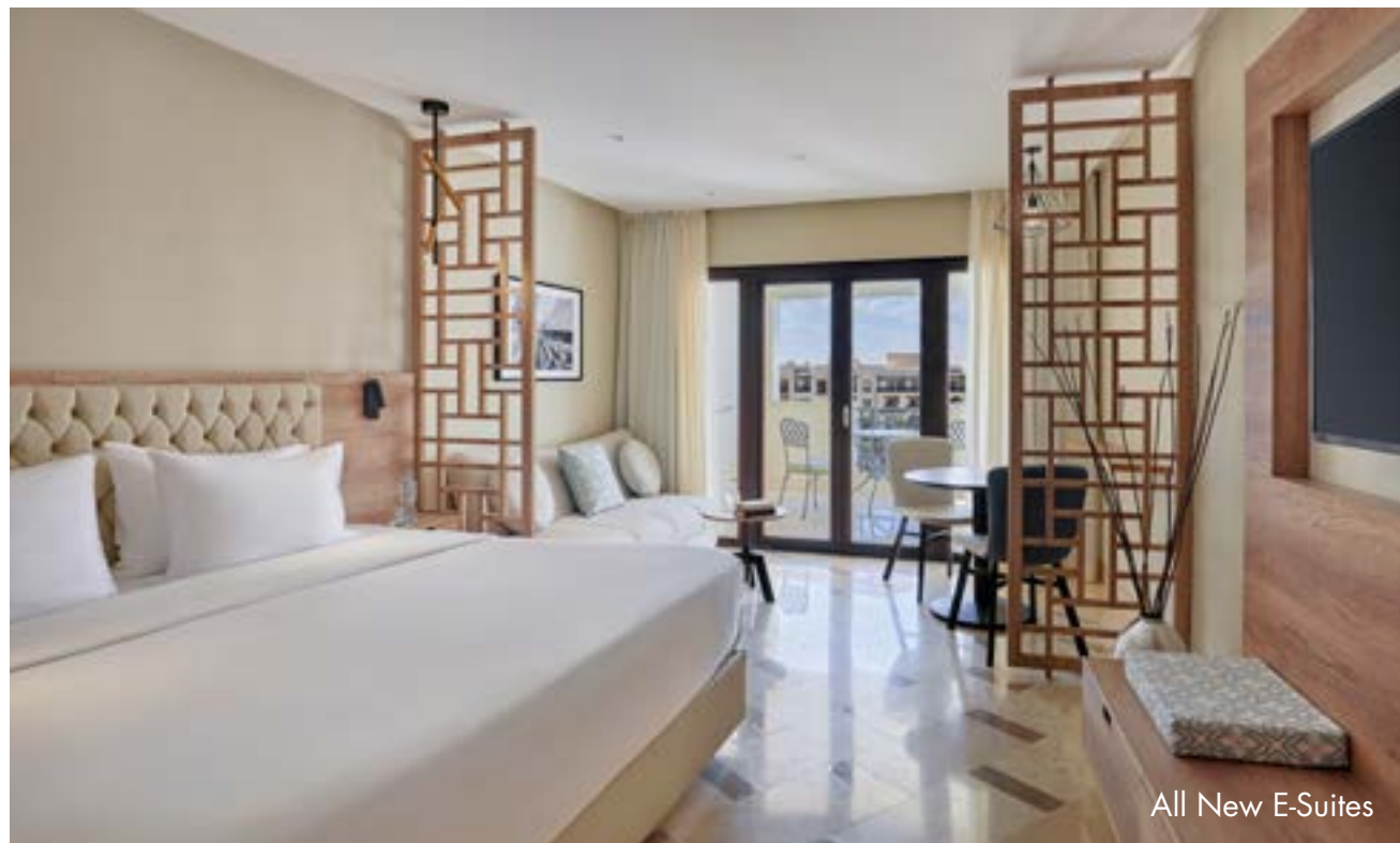
All New E-Suites