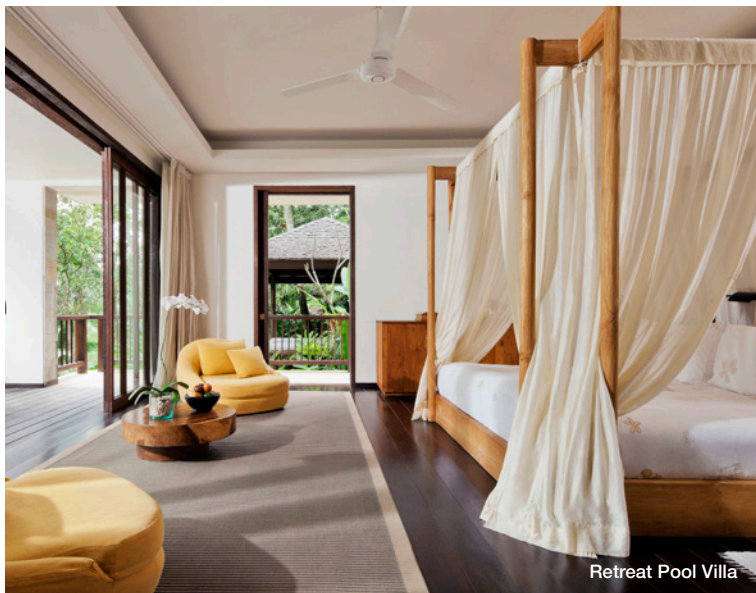
Retreat Pool Villa