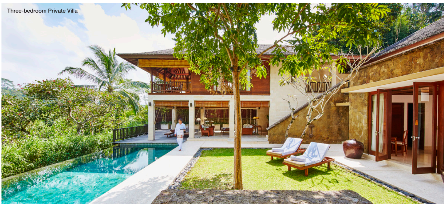
Three-bedroom Private Villa