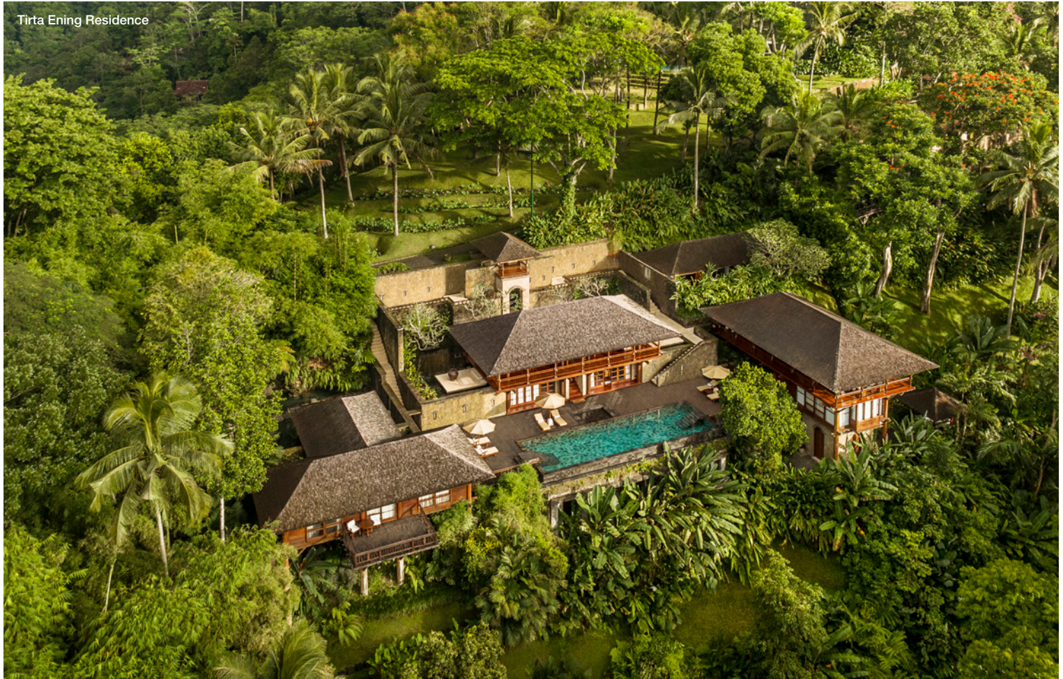
Tirta Ening Residence