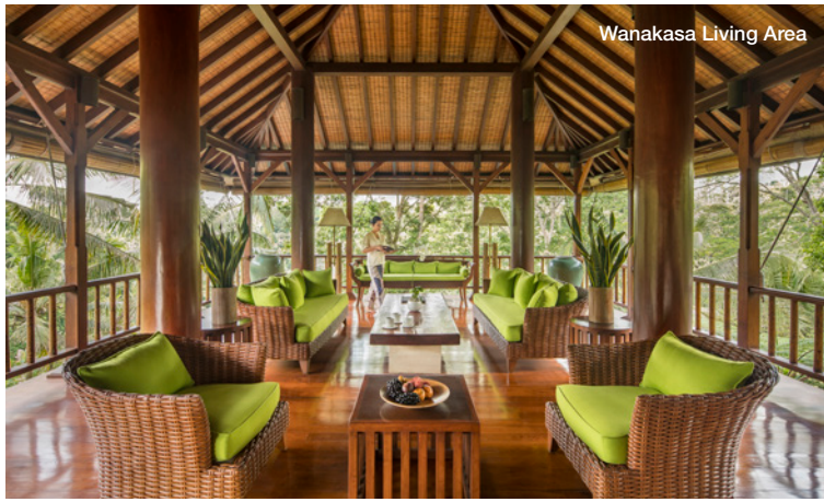
Wanakasa Living Area