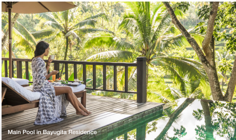
Main Pool in Bayugita Residence