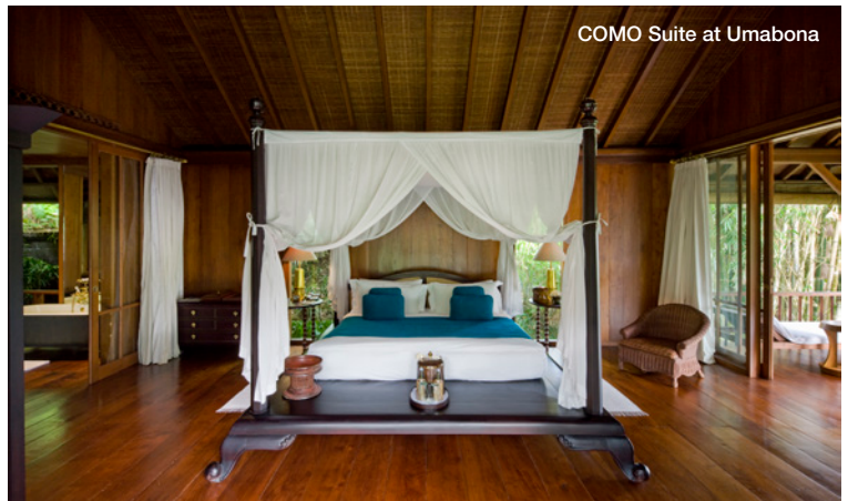
COMO Suite at Umabona