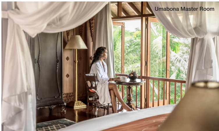
Umabona Master Room