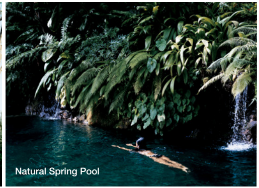
Natural Spring Pool