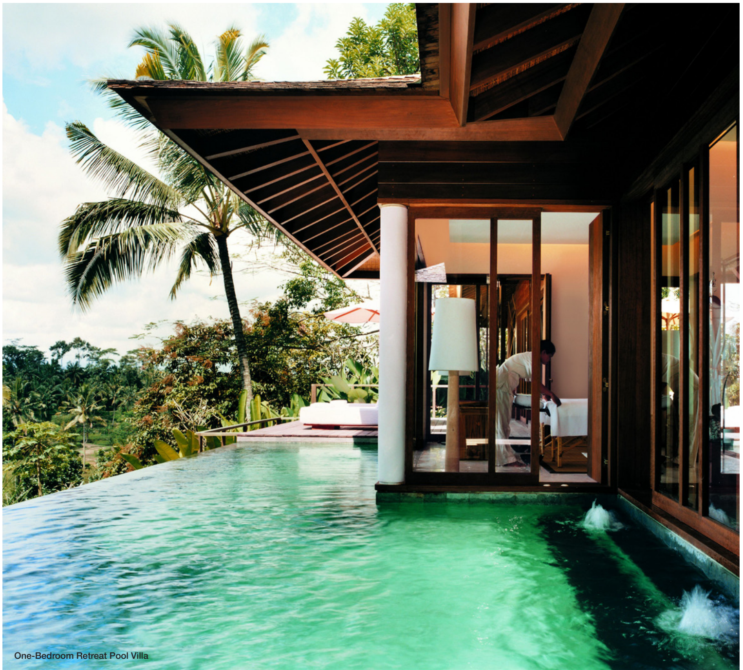
One-Bedroom Retreat Pool Villa