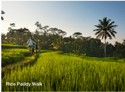
Rice Paddy Walk