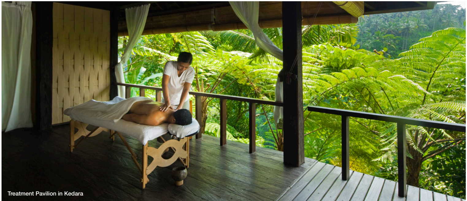
Treatment Pavilion in Kedara