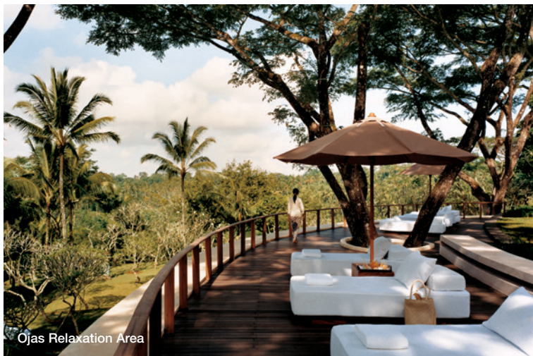
Ojas Relaxation Area