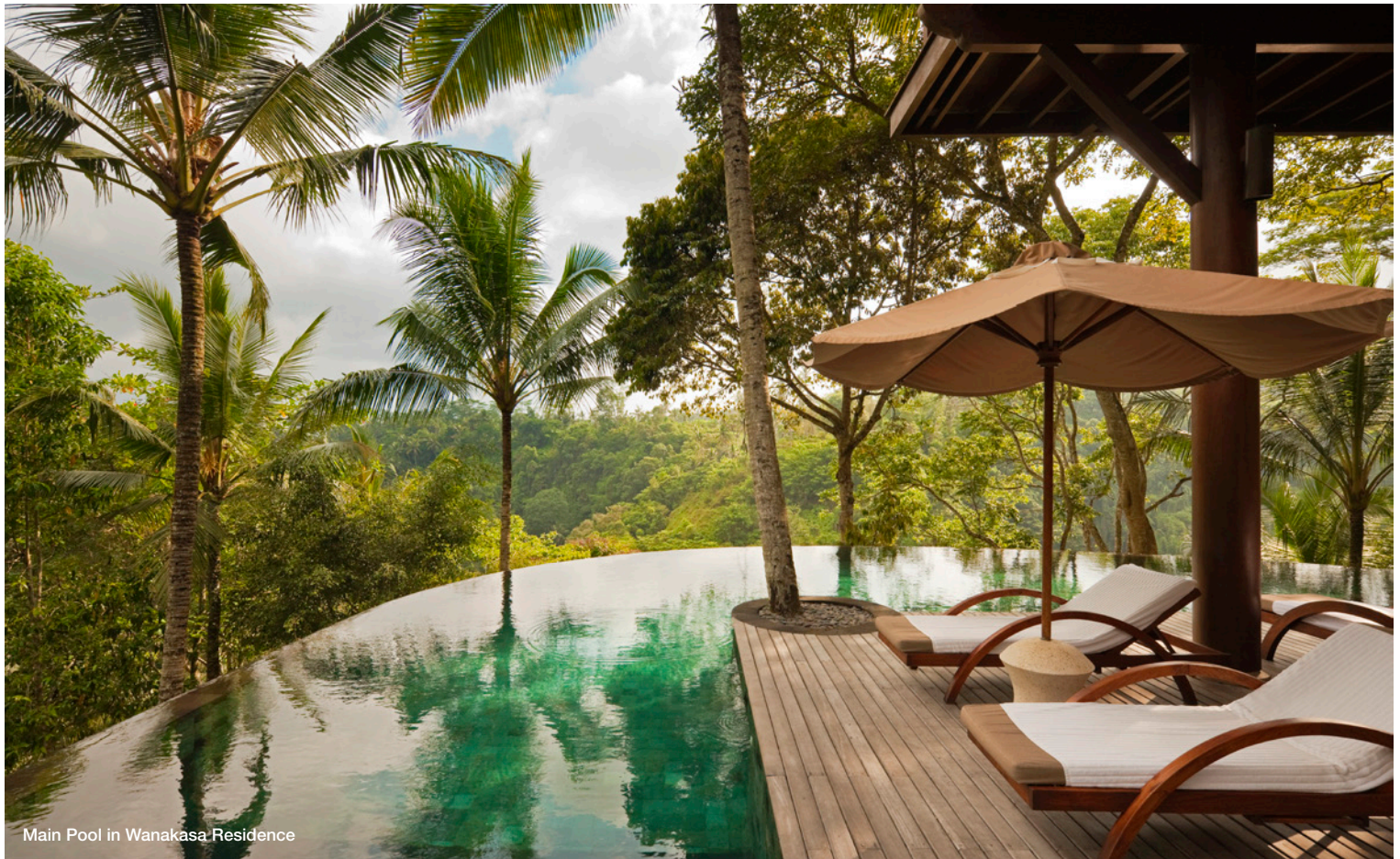
Main Pool in Wanakasa Residence