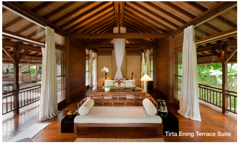
Tirta Ening Terrace Suite