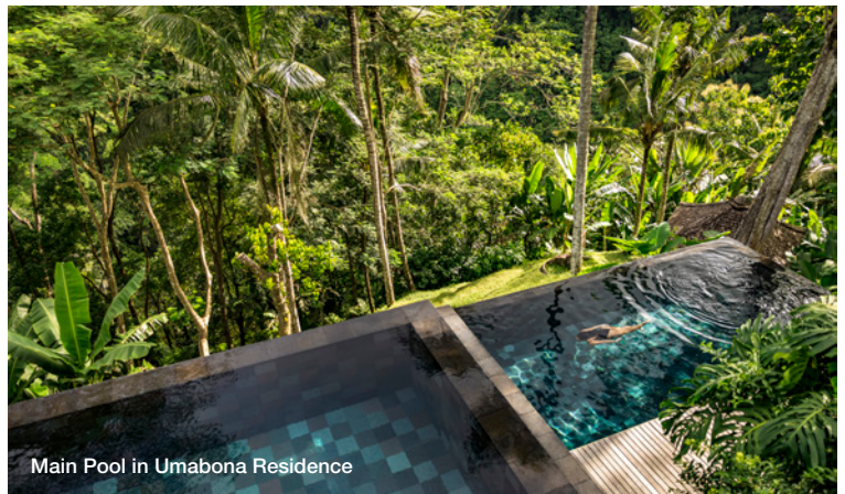
Main Pool in Umabona Residence