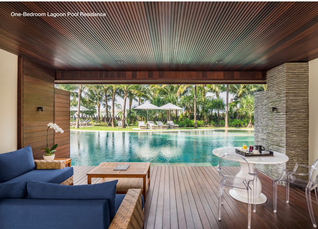
One-Bedroom Lagoon Pool Residence