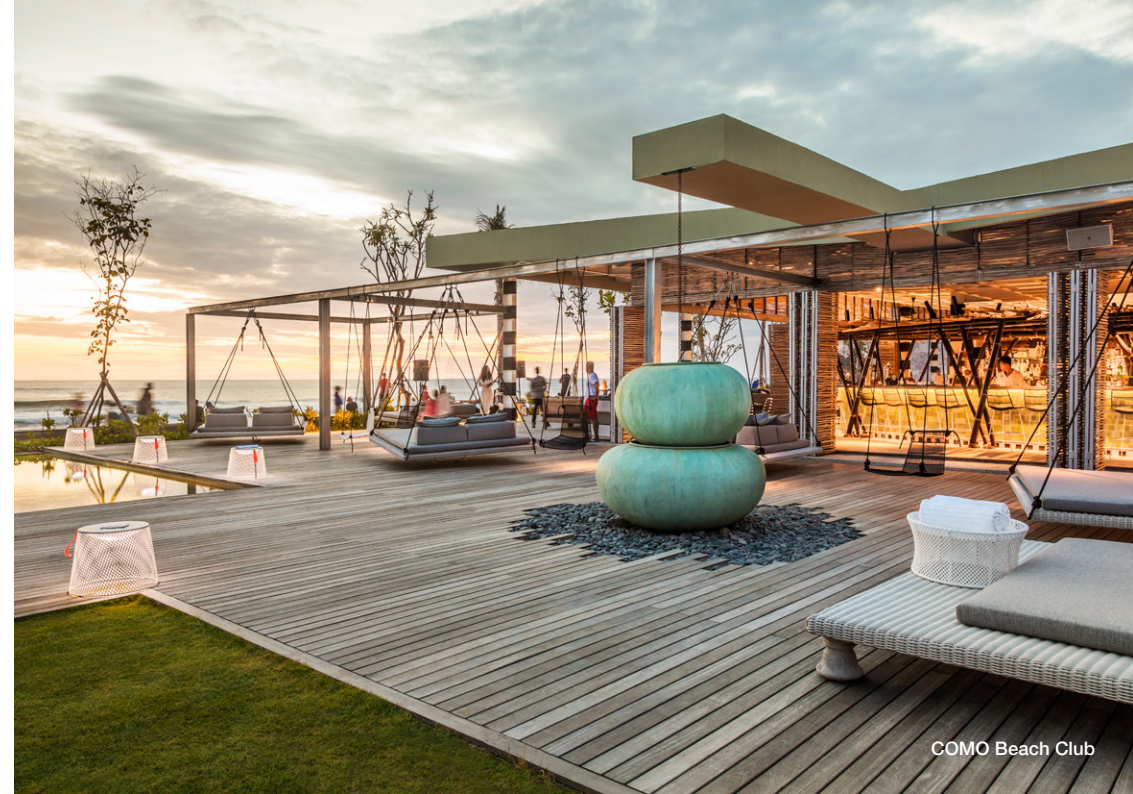
COMO Beach Club