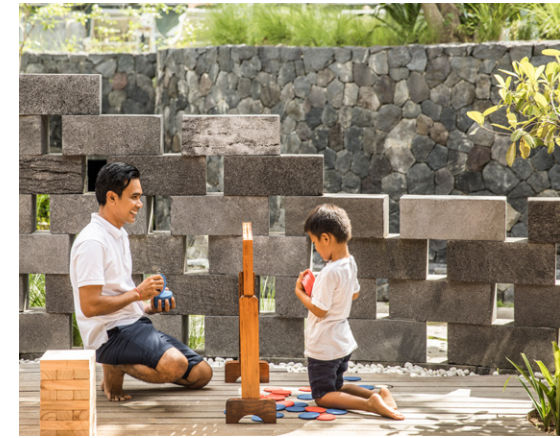
Play by COMO