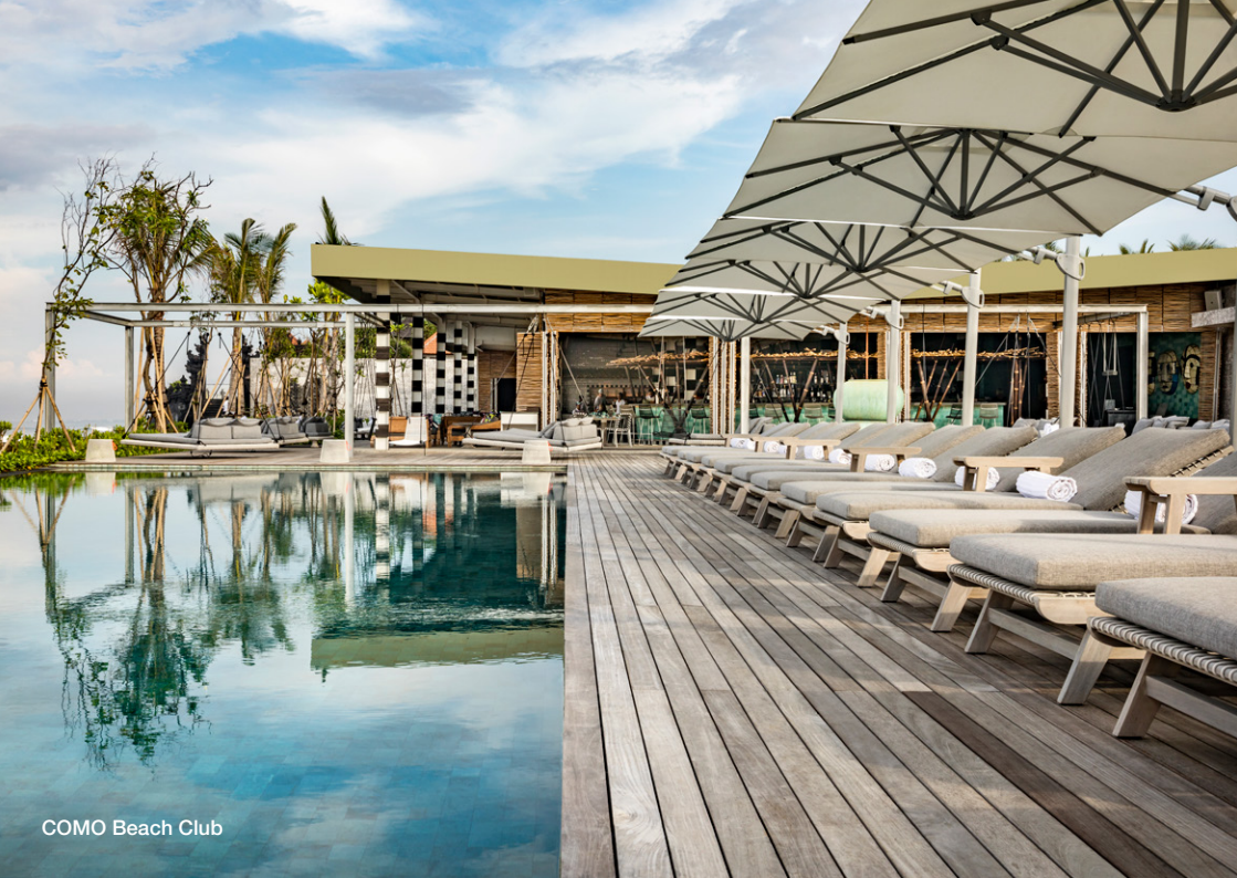
COMO Beach Club