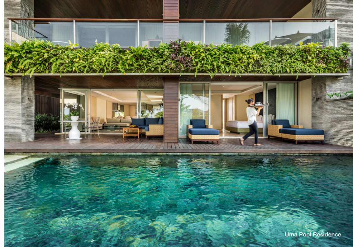
Uma Pool Residence