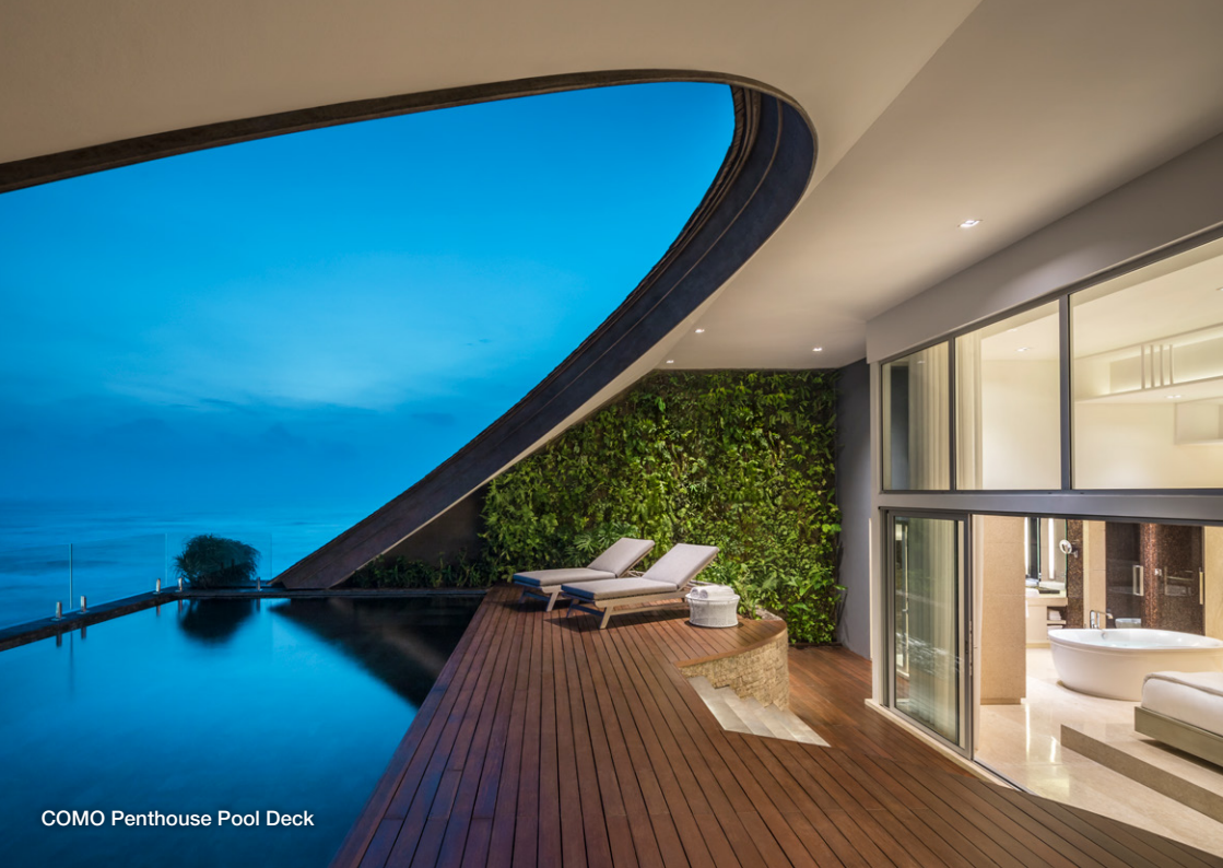
COMO Penthouse Pool Deck

3 Two-Bedroom Lagoon Pool Residences (200sq m): These residences have the same layout and facilities as the Two-Bedroom Residences, with the additional advantage of a ground floor location which opens out onto the COMO Uma Canggu lagoon pool.