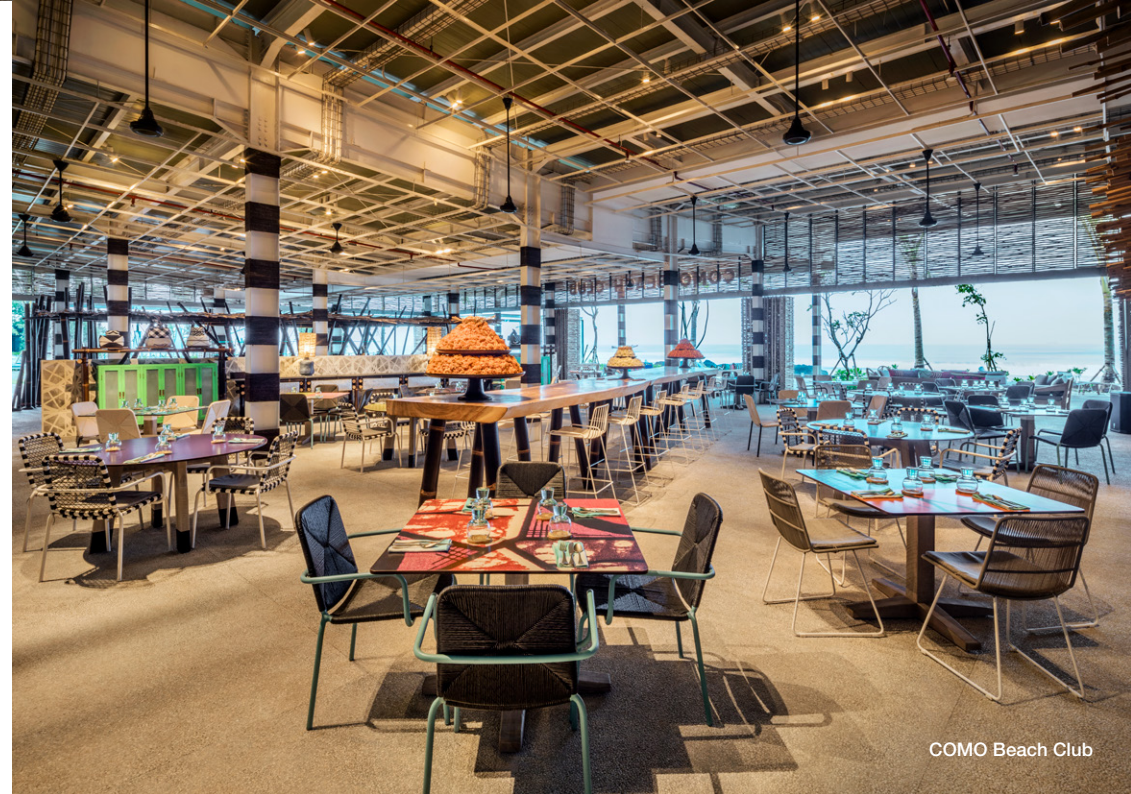
COMO Beach Club