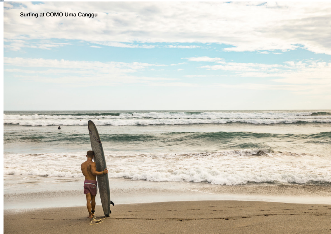
Surfing at COMO Uma Canggu

Tanah Lot is made up of sea temples standing on tide-shaped rocks on the west coast of Bali. This holy site is a popular place from which to see the spectacular sunset. According to lore, these sea temples were built by priest Nirartha, who asked a poisonous sea snake to guard the holy temple.