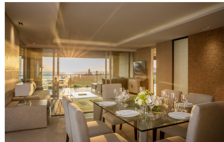
COMO Penthouse Dining Room