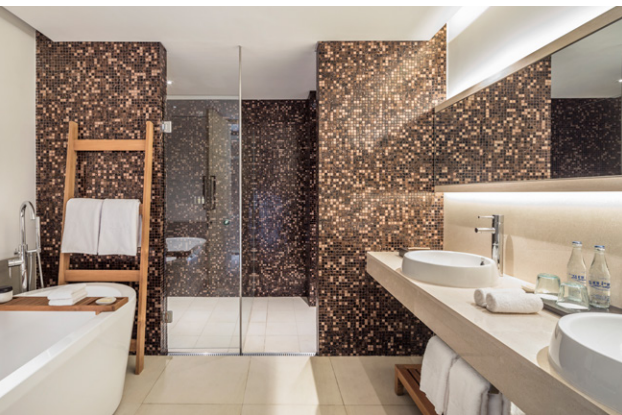
Garden Patio Bathroom

32 Canggu Rooms (36sq m): These rooms features king size and twin size beds draped in sateen cotton bed linen. The design is bright, open and modern.