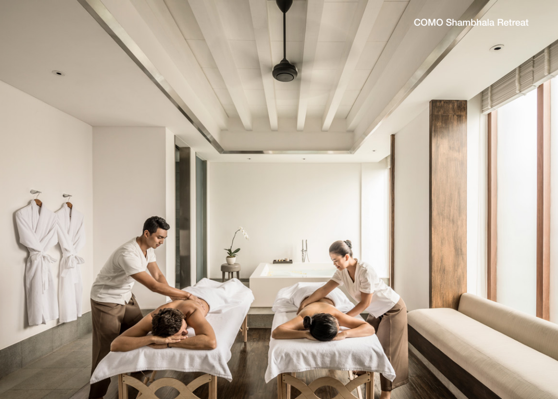
COMO Shambhala Retreat