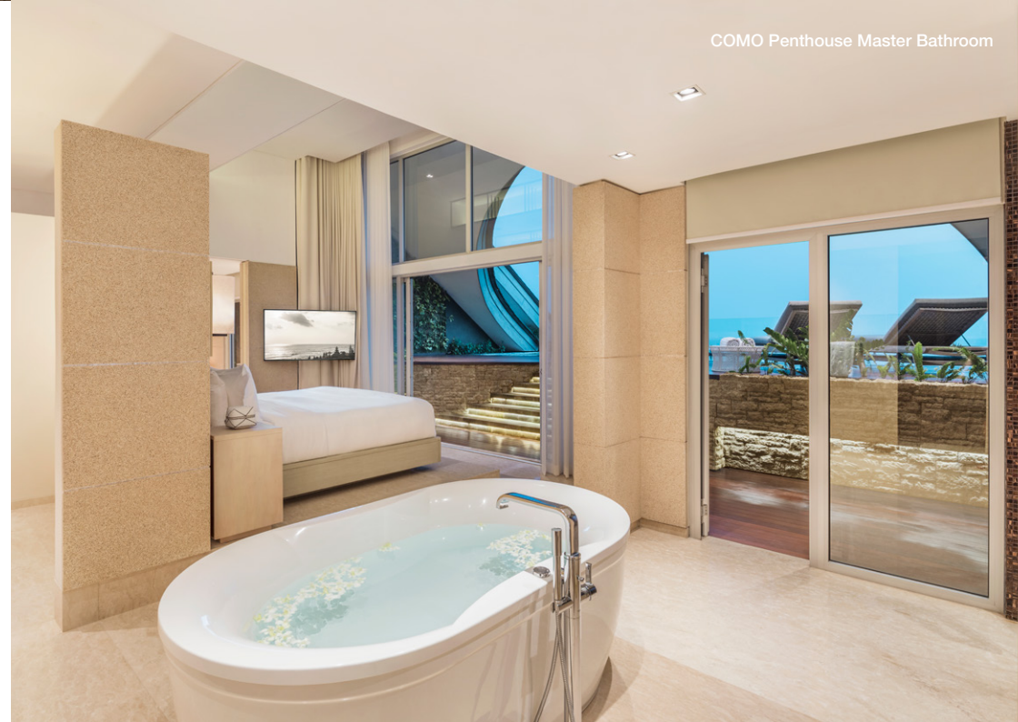
COMO Penthouse Master Bathroom

4 Two-Bedroom Seaview Residences (180sq m): Guests in these Two-Bedroom Residences have a wealth of stylish entertaining options: a large master balcony with a panoramic seaview, a spacious living room, and an airy, light-filled kitchenette. Both of the large en suite bathrooms are furnished with freestanding bathtubs.