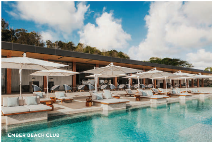
EMBER BEACH CLUB