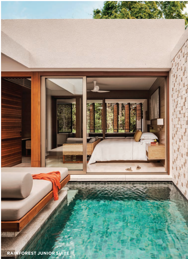
RAINFOREST JUNIOR SUITE