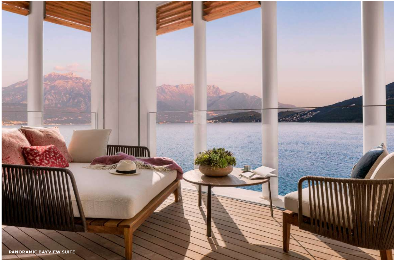
PANORAMIC BAYVIEW SUITE