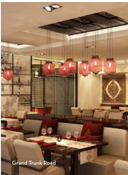
Grand Trunk Road