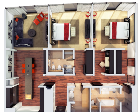
Wonderful Area 143 SQM