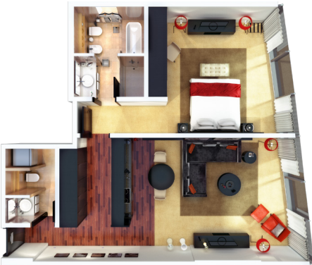
Warm Area 73 SQM