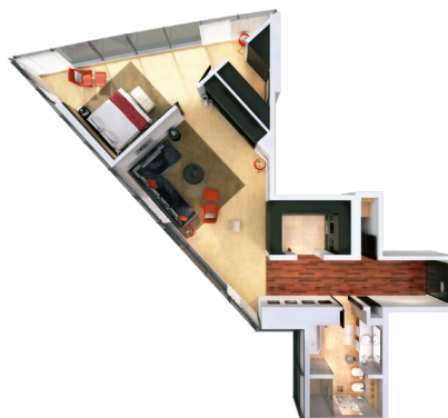
Witty Area 107 SQM