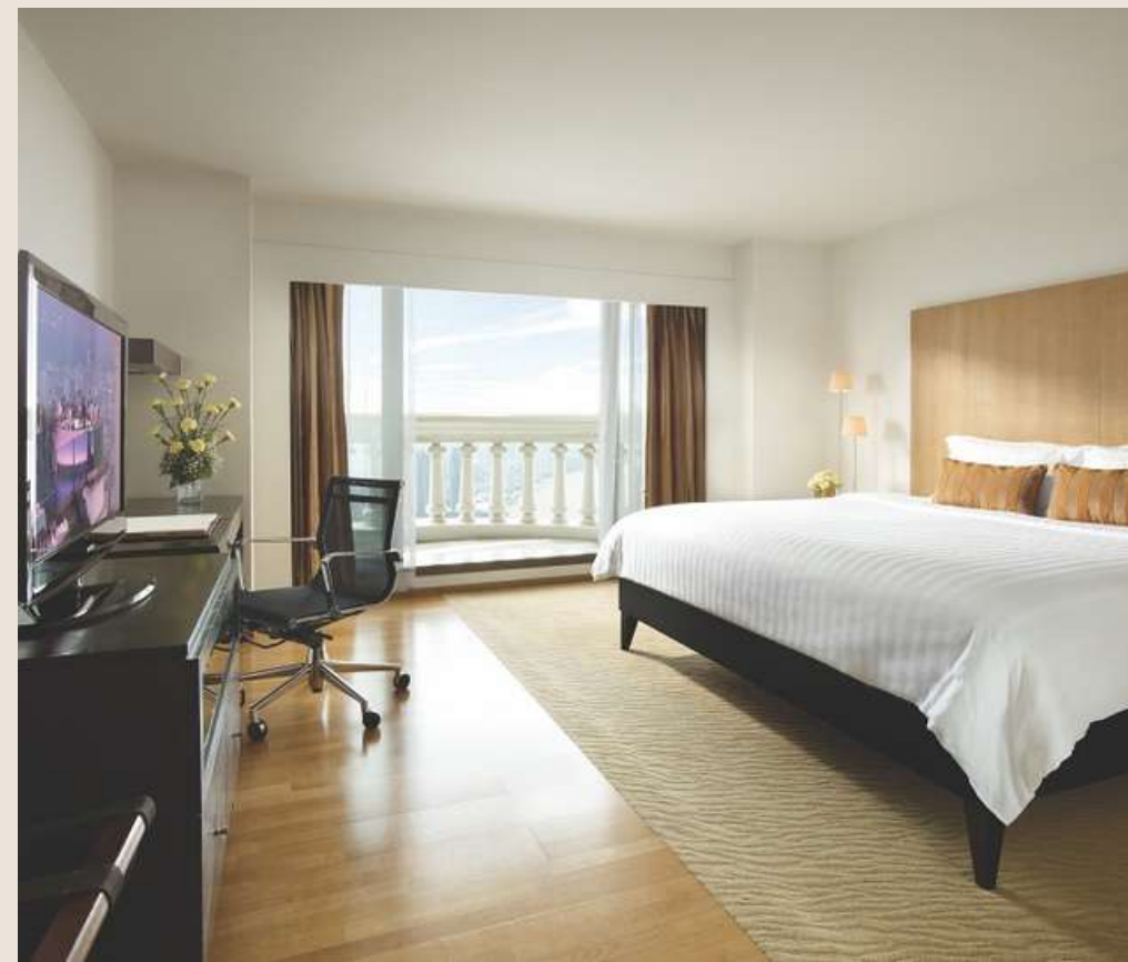
Tower Club Lounge Access included

All 1 Bedroom Suites come with either King Size, Twin, Super King bed. Separate living room. Private balcony offering beautiful views of Bangkok City or Chao Phraya River.