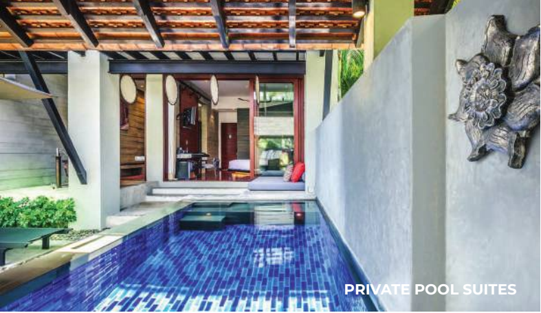
PRIVATE POOL SUITES