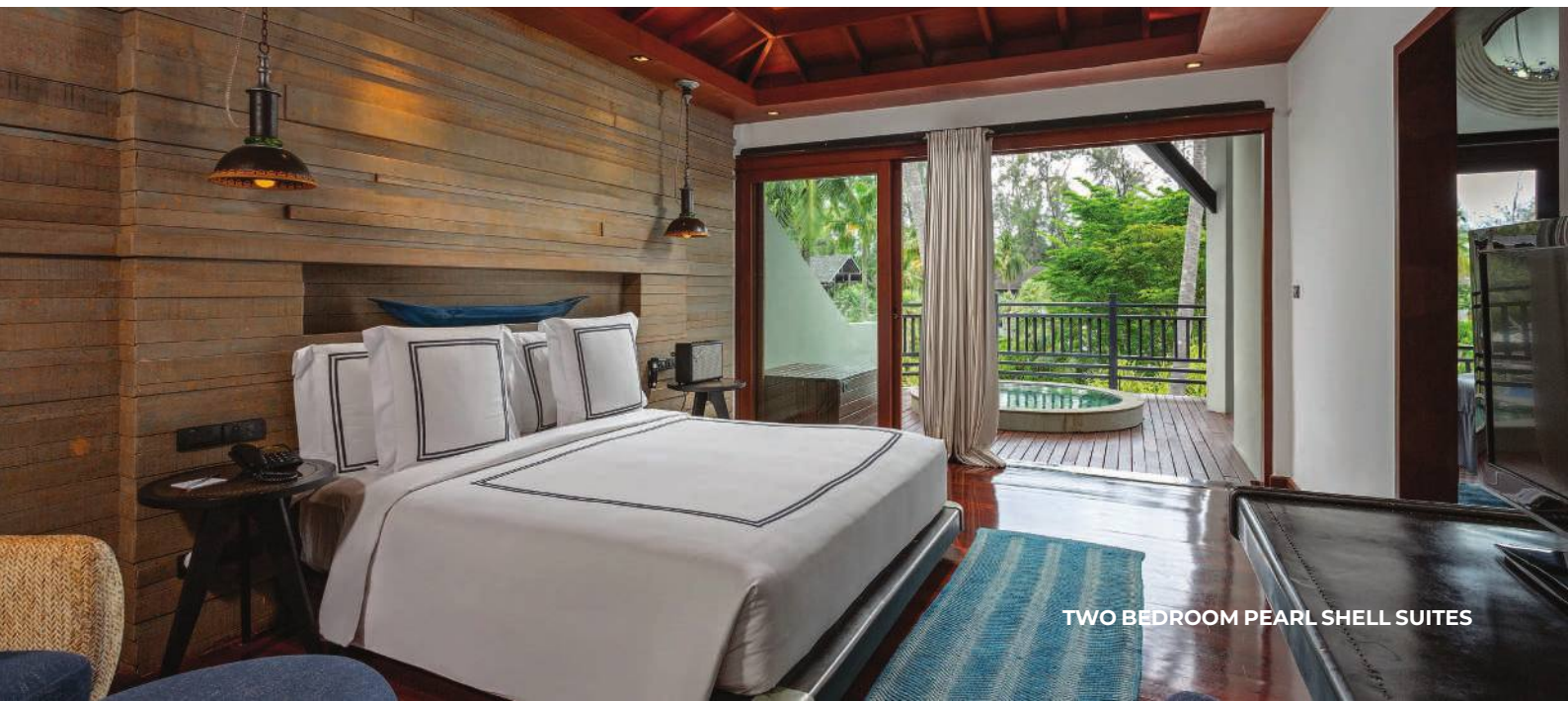
TWO BEDROOM PEARL SHELL SUITES