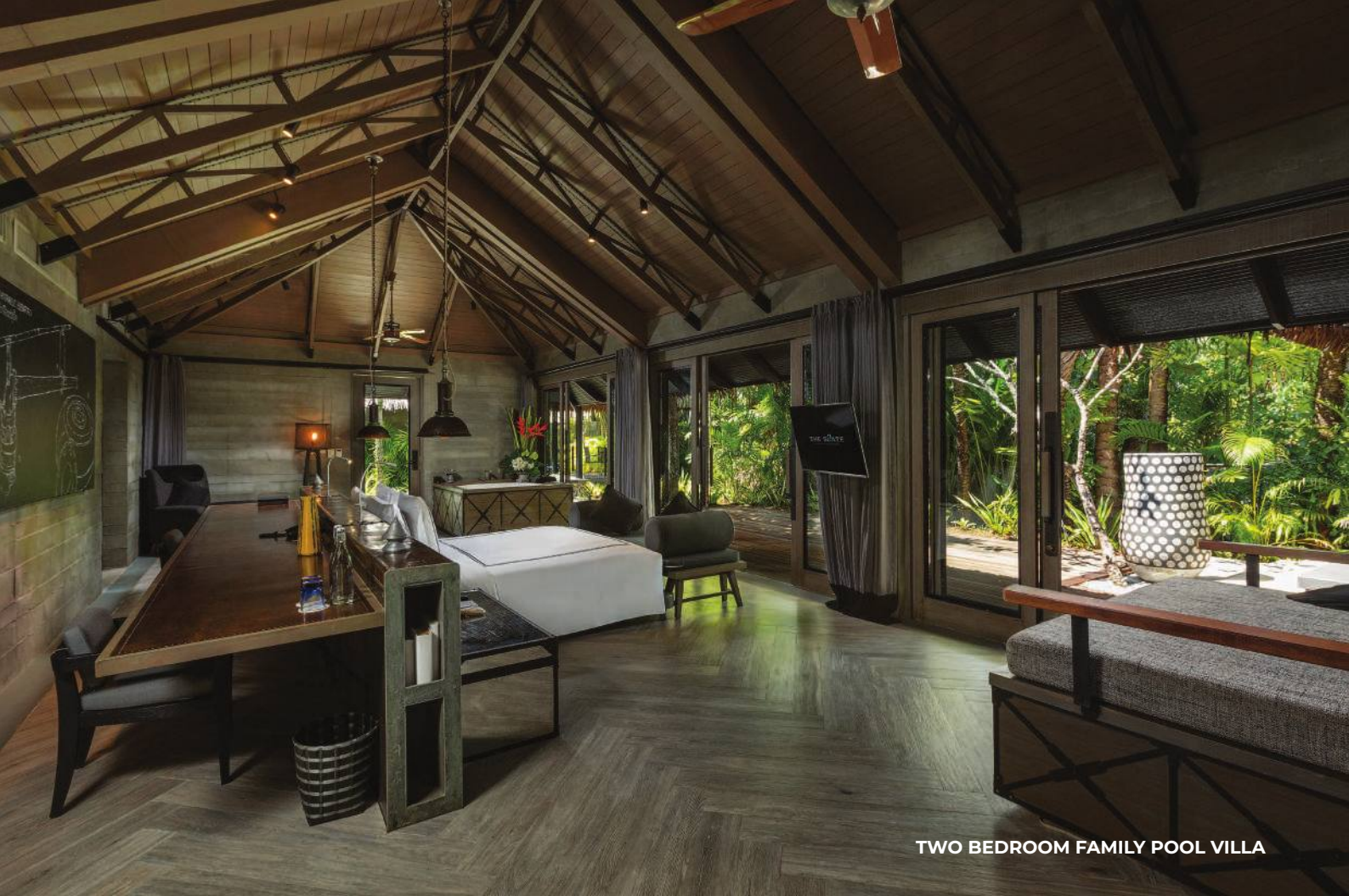
TWO BEDROOM FAMILY POOL VILLA