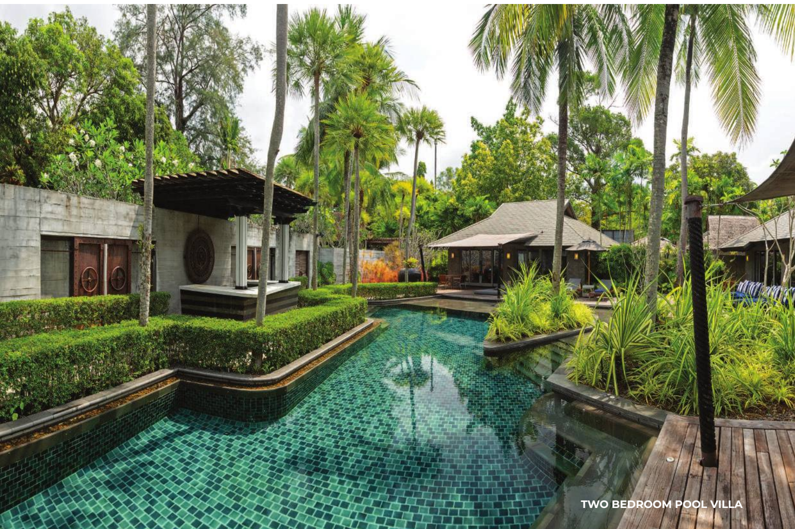
TWO BEDROOM POOL VILLA