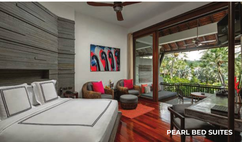
PEARL BED SUITES