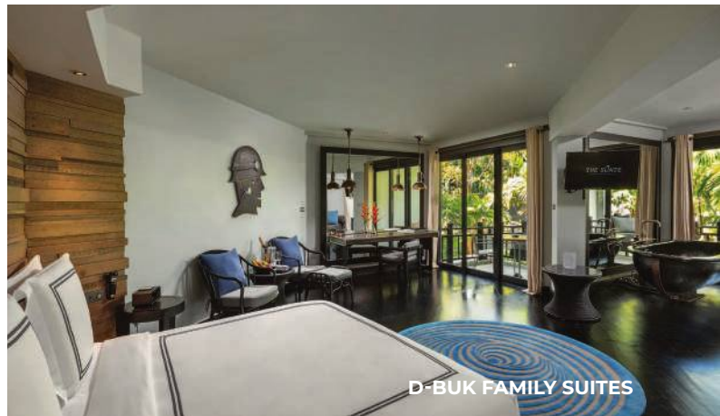
D-BUK FAMILY SUITES