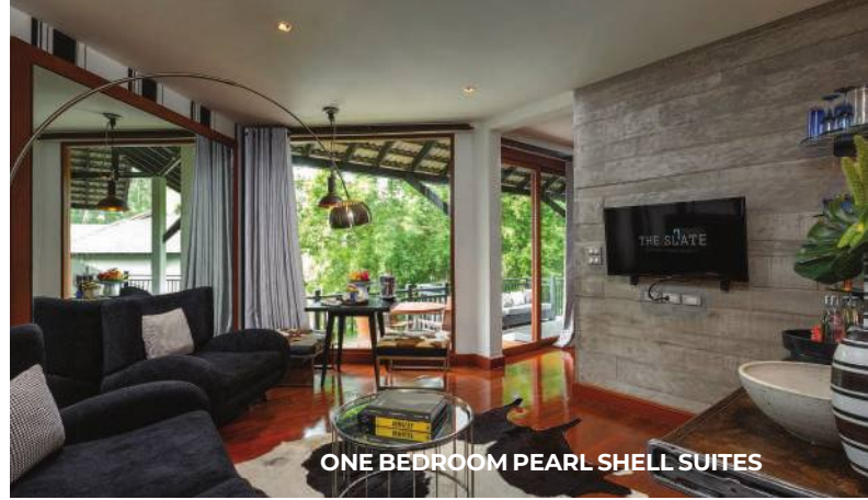
ONE BEDROOM PEARL SHELL SUITES