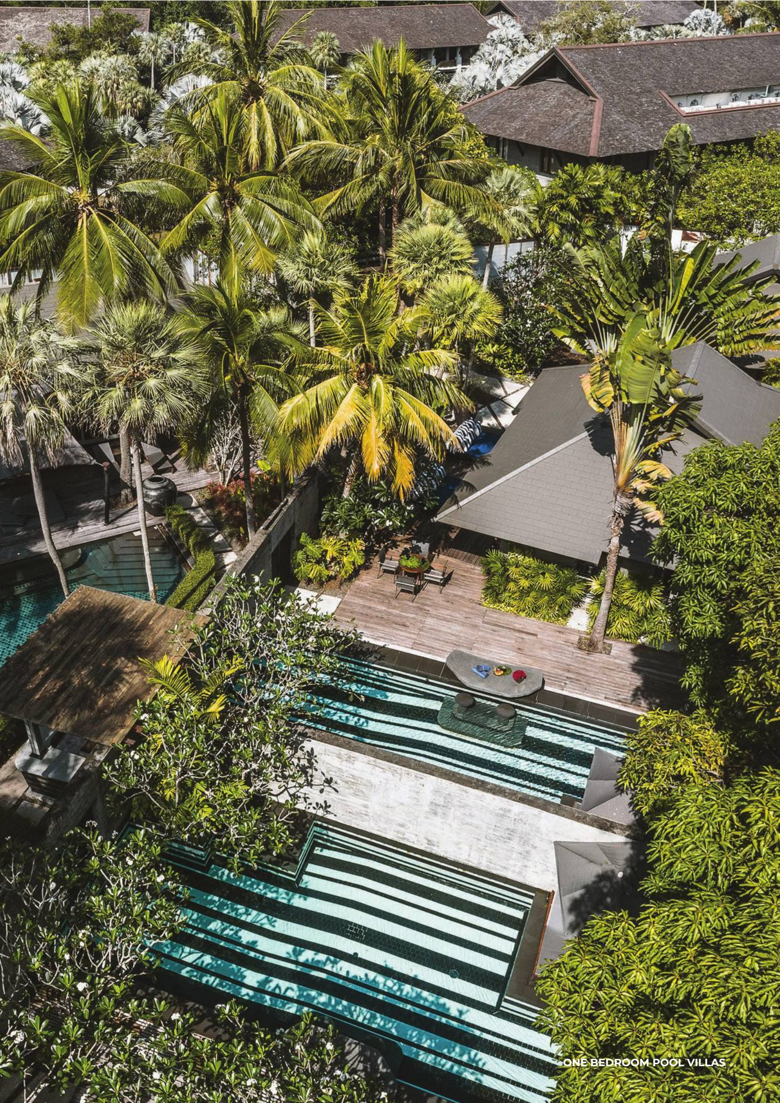
ONE BEDROOM POOL VILLAS