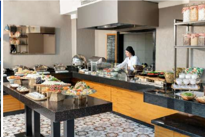
Pub, Starbucks and Lobby Lounge