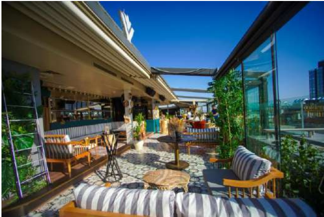
À La Carte Restaurant