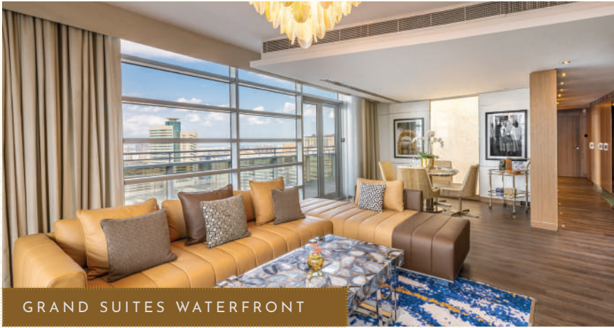
GRAND SUITES WATERFRONT