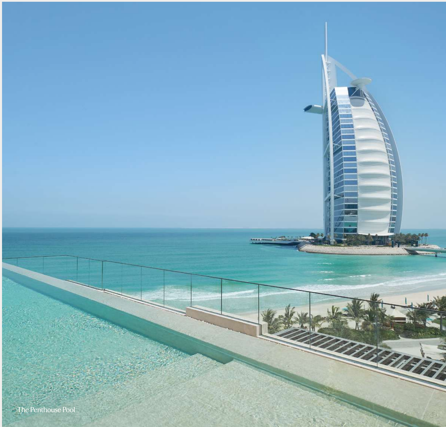
The Penthouse Pool