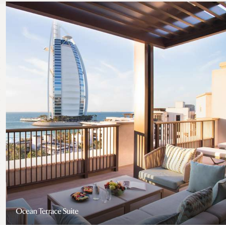
Ocean Terrace Suite