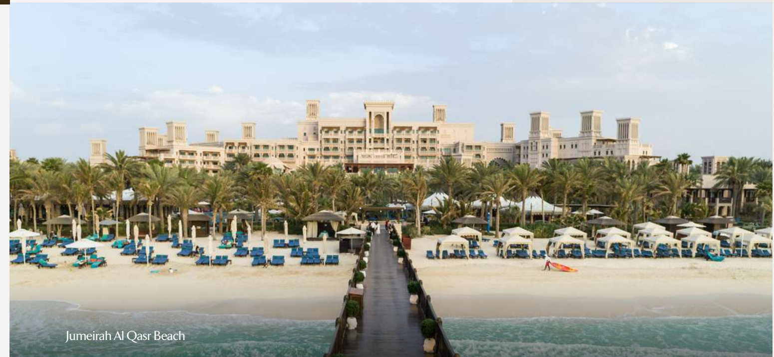
Jumeirah Al Qasr Beach