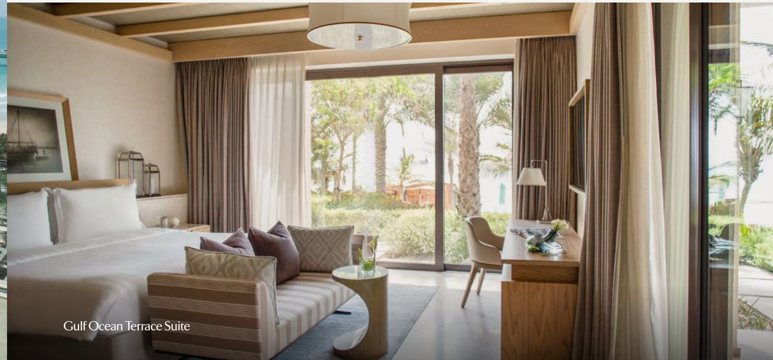
Gulf Ocean Terrace Suite