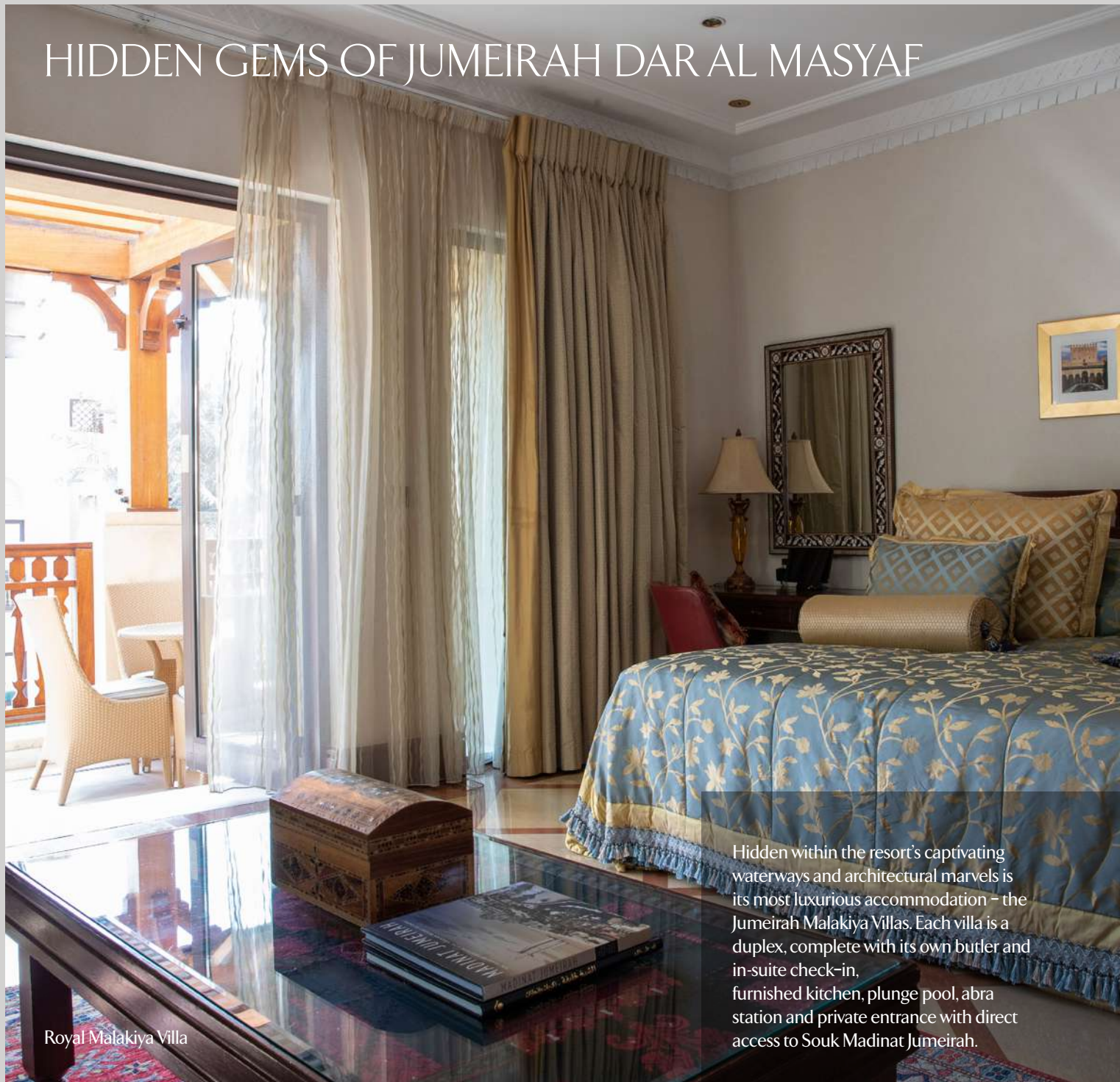
Royal Malakiya Villa

Hidden within the resort's captivating waterways and architectural marvels is its most luxurious accommodation – the Jumeirah Malakiya Villas. Each villa is a duplex, complete with its own butler and in-suite check-in, furnished kitchen, plunge pool, abra station and private entrance with direct access to Souk Madinat Jumeirah.