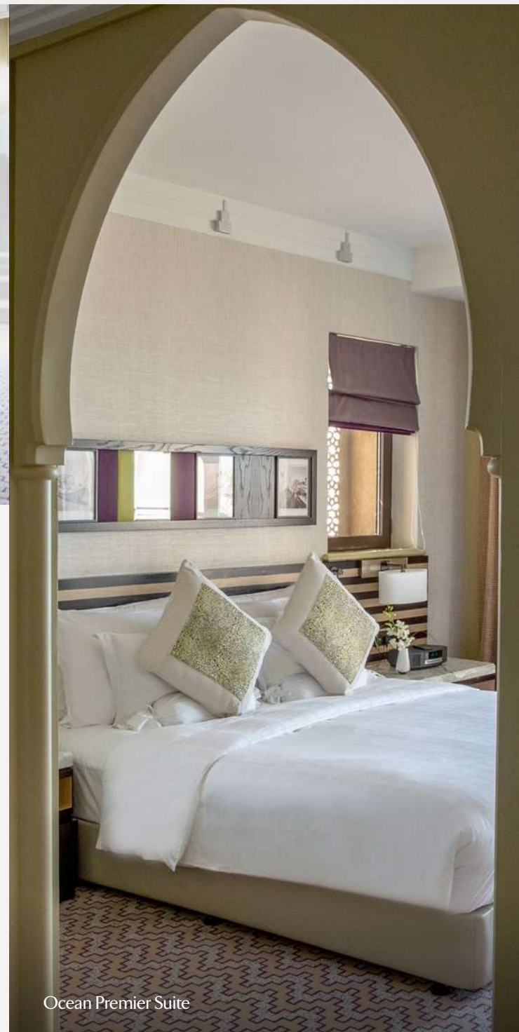
Ocean Premier Suite