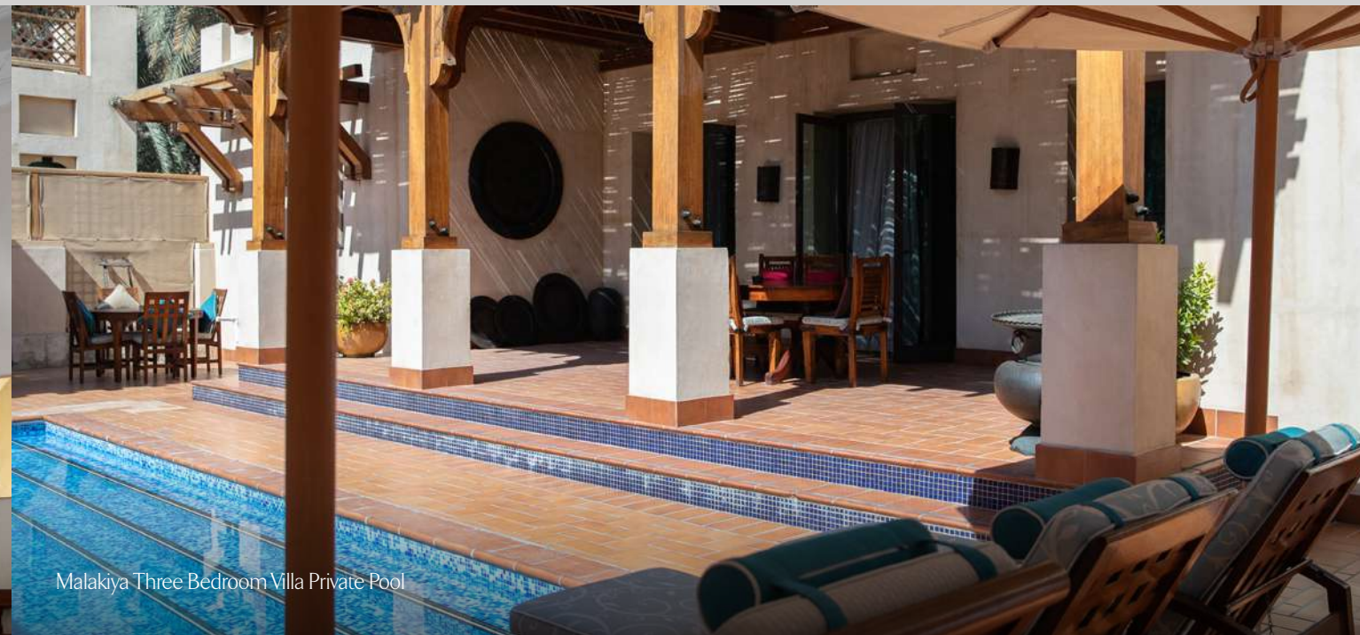
Malakiya Three Bedroom Villa Private Pool

Hidden within the resort's captivating waterways and architectural marvels is its most luxurious accommodation – the Jumeirah Malakiya Villas. Each villa is a duplex, complete with its own butler and in-suite check-in, furnished kitchen, plunge pool, abra station and private entrance with direct access to Souk Madinat Jumeirah.