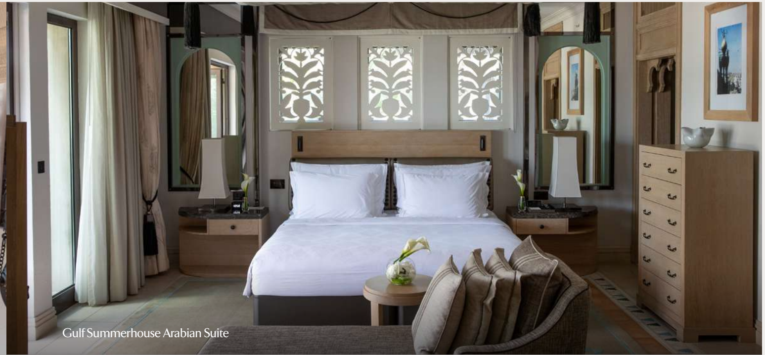
Gulf Summerhouse Arabian Suite