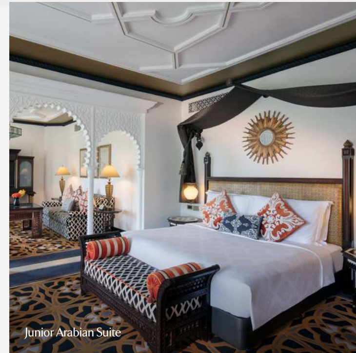
Junior Arabian Suite