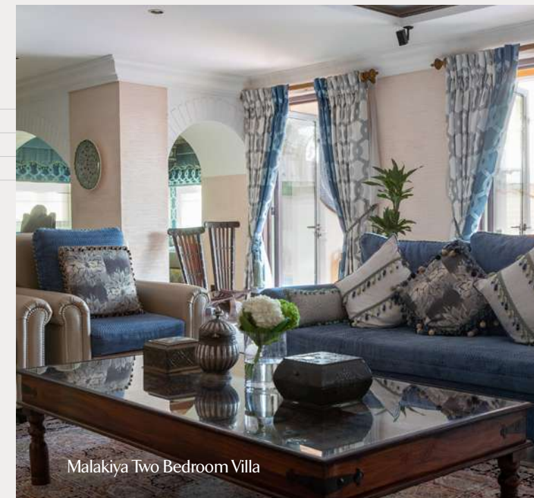
Malakiya Two Bedroom Villa